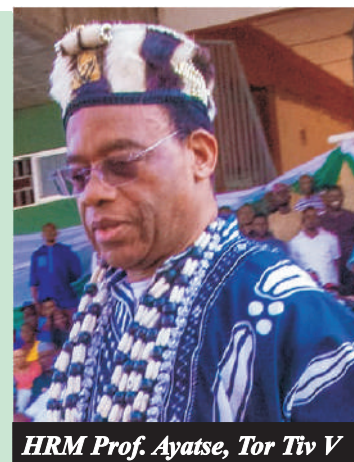
HRM Prof. Ayatse, Tor Tiv V

Over 20 Bodies Recovered, 50 Rescued In Benue Boat Mishap >>>page 08