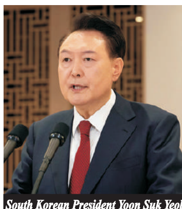
South Korean President Yoon Suk Yeol

“If martial law had not been lifted that night, a bloody