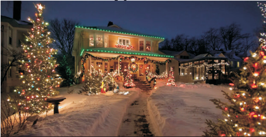
Snow blankets a home decked out for the holiday season

C hristmas is approaching nearly as fast as Santa's sleigh, but almost anyone in the United States fantasizing about a movie-worthy white Christmas might need to keep dreaming.