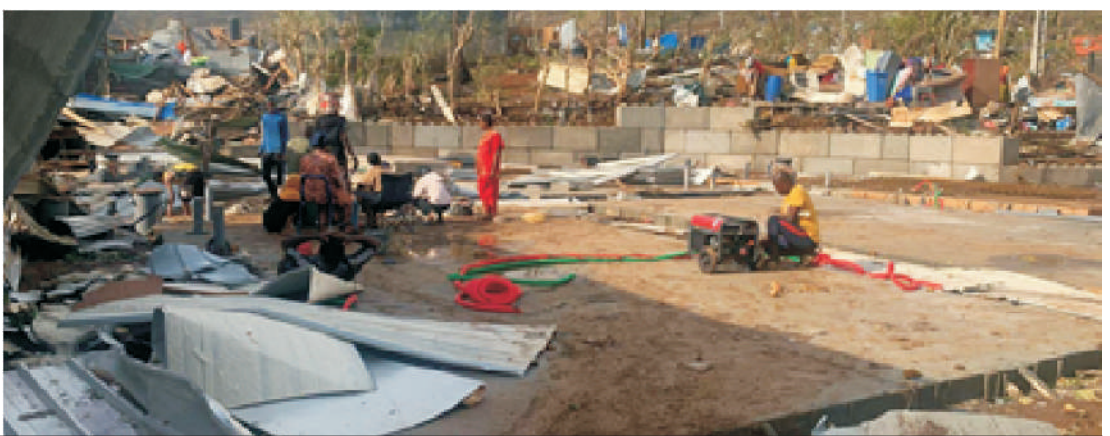
Residents in France's Indian Ocean territory of Mayotte sit among piles of debris of metal sheets and wood on December 15 after homes were destroyed by Cyclone Chido.

Pope Francis offered prayers for the victims while on a visit Sunday to the French Mediterranean island of Corsica.