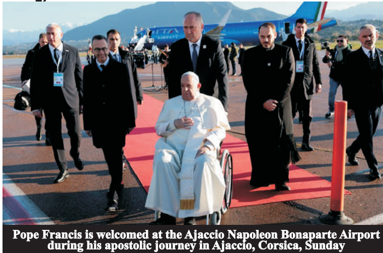
Pope Francis is welcomed at the Ajaccio Napoleon Bonaparte Airport during his apostolic journey in Ajaccio, Corsica, Sunday

Macron had invited Francis to attend the December 7 reopening of Notre Dame Cathedral, five years after a devastating fire nearly destroyed the medieval building. The pope decided not to go, and the two will instead meet briefly at Ajaccio's airport on Sunday before Francis heads back to