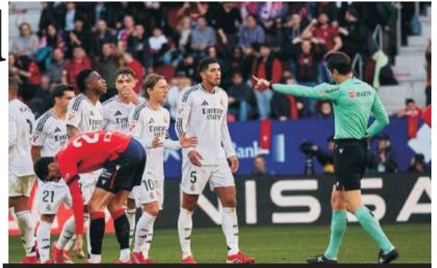
Jude Bellingham of Real Madrid CF after receiving a red card