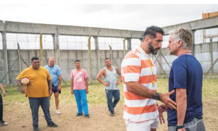
Actors stand during the filming of a scene of the series "Spartans", in the Penal Unit No. 48, in San Martin, on the outskirts of Buenos Aires, Argentina

The plan faced challenges including convincing skeptical prison directors to let hardened criminals scrum and tackle in a physical contact game, but it worked. Prisoners who played in the teams had a re-offending rate of 5%, far below the average in the Argentine prison system of 65%. Fewer