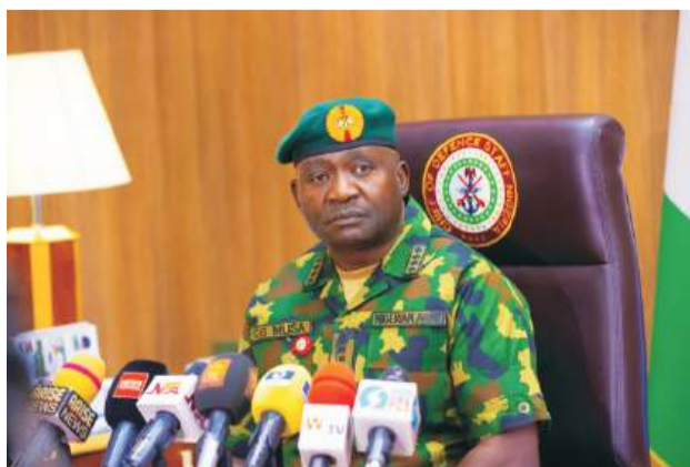
General Christopher Musa.

"The Invictus Foundation Centre, which is the first in Africa and currently under construction, is part of this initiative to provide care and mental healing for our wounded personnel."