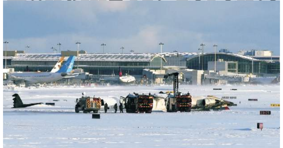
Pearson International Airport firefighters work on an upside down Delta Air Lines plane, which was heading from Minneapolis to Toronto when it crashed on the runway, in Toronto, Monday, Feb. 17, 2025

"The thugs arrived, they took everything, and nothing remains. I'm really upset. I don't know how I'm going to