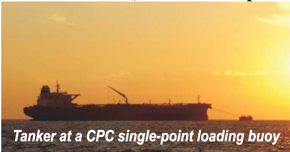
Tanker at a CPC single-point loading buoy

14-Year-Old Indian "Human Calculator" Sets Six Math World Records