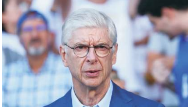
I pray, but I have to improve the quality of my praying' – Arsène Wenger on Arsenal title chances

Legendary former Arsenal manager Arsene Wenger has jokingly admitted that he may need to pray harder if the Gunners are to end their two-decade-long Premier League title drought this season. The Frenchman subtly acknowledged that Mikel Arteta's side faces an uphill battle, with Liverpool still holding a seven-point lead at the top of the table. The 75-year-old, who led Arsenal to their last league triumph in 2004's Invincible season, knows just how difficult it will be for his former club to reclaim the title. However, he hasn't lost hope—turning to faith as a last resort. Wenger broke down Arsenal's title chances, highlighting how dominant Liverpool have been this season, saying, "Look, it's simple. They