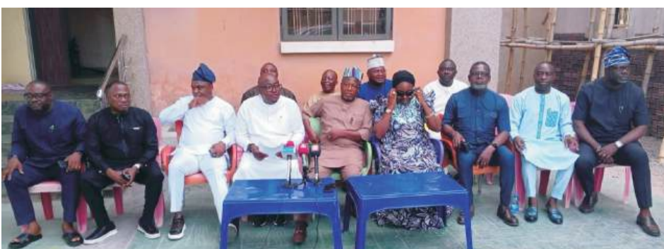
Th 13 members of the Benue House Assembly who Rejected the Removal of the Chief Judge

unconstitutional," the statement read. The NBA further criticized the Benue State House of Assembly for attempting to address allegations of financial impropriety without following the lawful procedures established in Section 292 of the Constitution. The NBA called upon all elected officials to refrain from actions that undermine judicial independence and urged law enforcement agencies to protect Justice Ikpambese from any harassment or intimidation that could obstruct his duties. In addition, the association warned judges in the Benue State High Court against accepting any offers to act as the state Chief Judge in the absence of a legitimate vacancy. It also called for a boycott of courts presided over by any judge who accepts such an appointment, while urging the NJC to sanction any judges involved in this matter. The NBA said it remains steadfast in its commitment to upholding the integrity of the Nigerian judiciary and demanded that the Benue State House of Assembly rescinds its resolution.